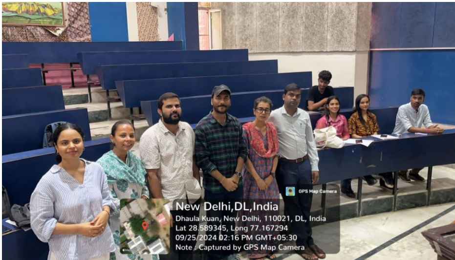
New Delhi, DL, India Dhaura Kuan, New Delhi, 110021, DL, India Lat 28.589345, Long 77.167294 09/25/2024 02:16 PM GMT+05:30 Note : Captured by GPS Map Camera