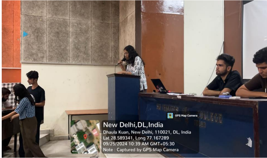
New Delhi, DL, India Dhaura Kuan, New Delhi, 110021, DL, India Lat 28.589341, Long 77.167289 09/25/2024 10:39 AM GMT+05:30 Note : Captured by GPS Map Camera